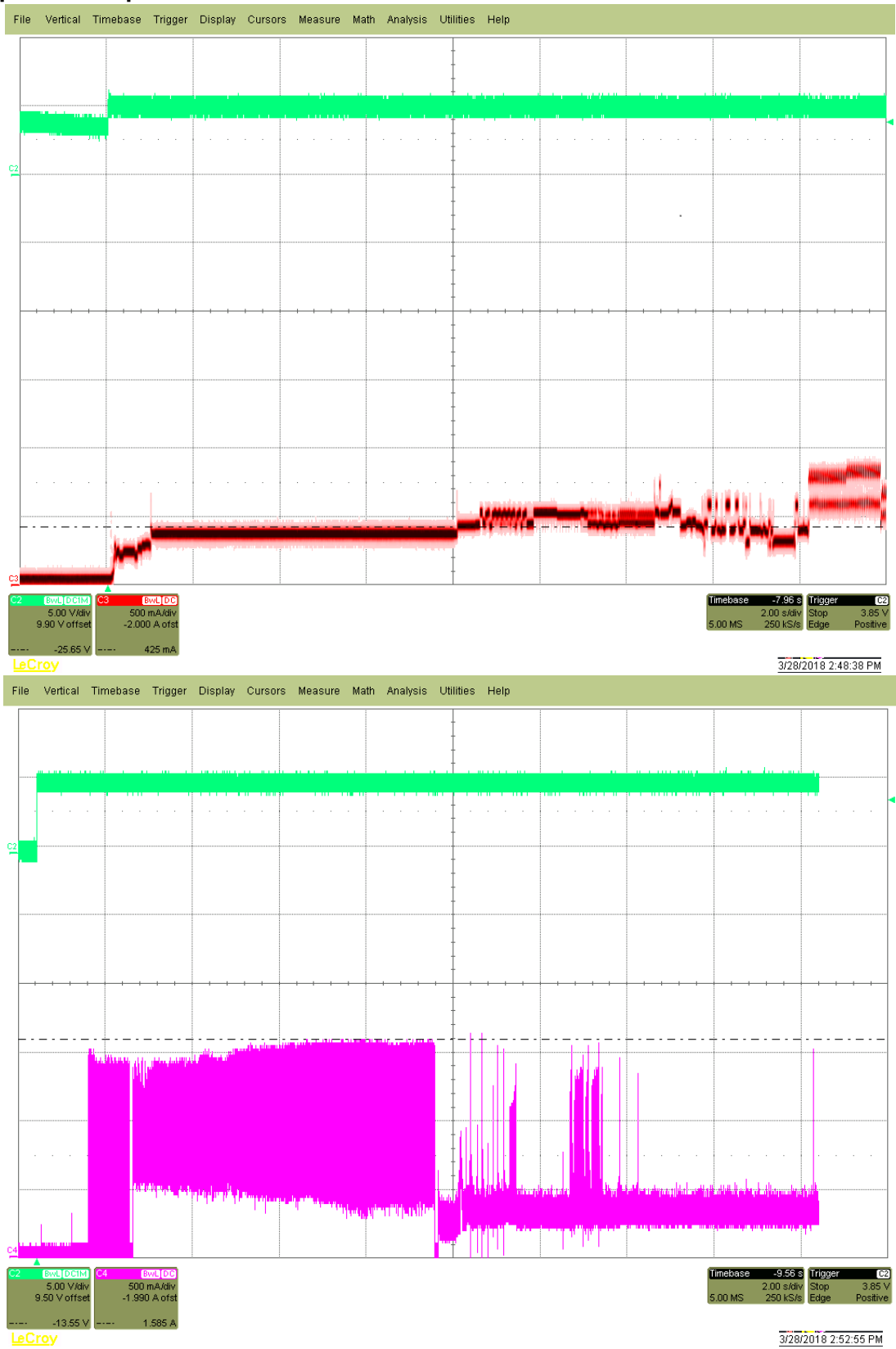
Figure 1. Typical 5V and 12V startup and operation current profiles