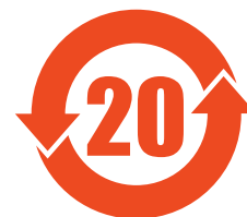
Table 6 Hazardous Substances

(Name and Content of the Hazardous Substances in Product)